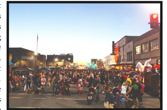
2017 Goblins on Grand

Our Promotion Committee markets our downtown district to attract shoppers, visitors, retailers and investors through events and other efforts. It is through the efforts of this hard-working group of volunteers that we are able to host community events like DxDT, Crazy Days Street Party, Ladies Night on Grand and Goblins on Grand. Additionally, beginning this fall they are working on hosting First Friday events each month. Be sure to check out the updated version of our Shop, Eat, Play brochure for information on all things Downtown Ponca City.