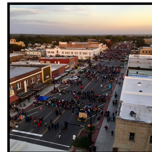
2017 Goblins on Grand

Our Design Committee works to enhance the downtown district through their work facilitating our 50/50 matching grant programs. It is a great joy of our organization to be able to put money back in the pocket of our members. Three façade grants were awarded during the 2017-2018 fiscal year. This Committee also works on art projects downtown. They began the Art in the Alley project last fall and added artwork to two additional signal boxes this spring.