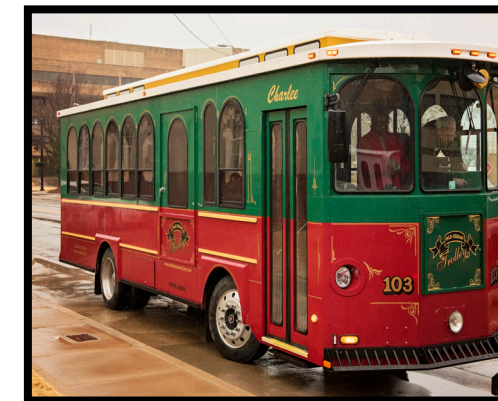
2018 Annual Awards Banquet

Our Grand Arts District Committee works on new and dynamic ways to keep our downtown and our organization relevant. Bringing art downtown is a passion of this Committee. Our first mural was completed downtown early this spring. The Committee is still working with the Oklahoma Arts Council on the creation of an arts and culture district in downtown and is now also exploring alternative ways we might be able to fund downtown growth.